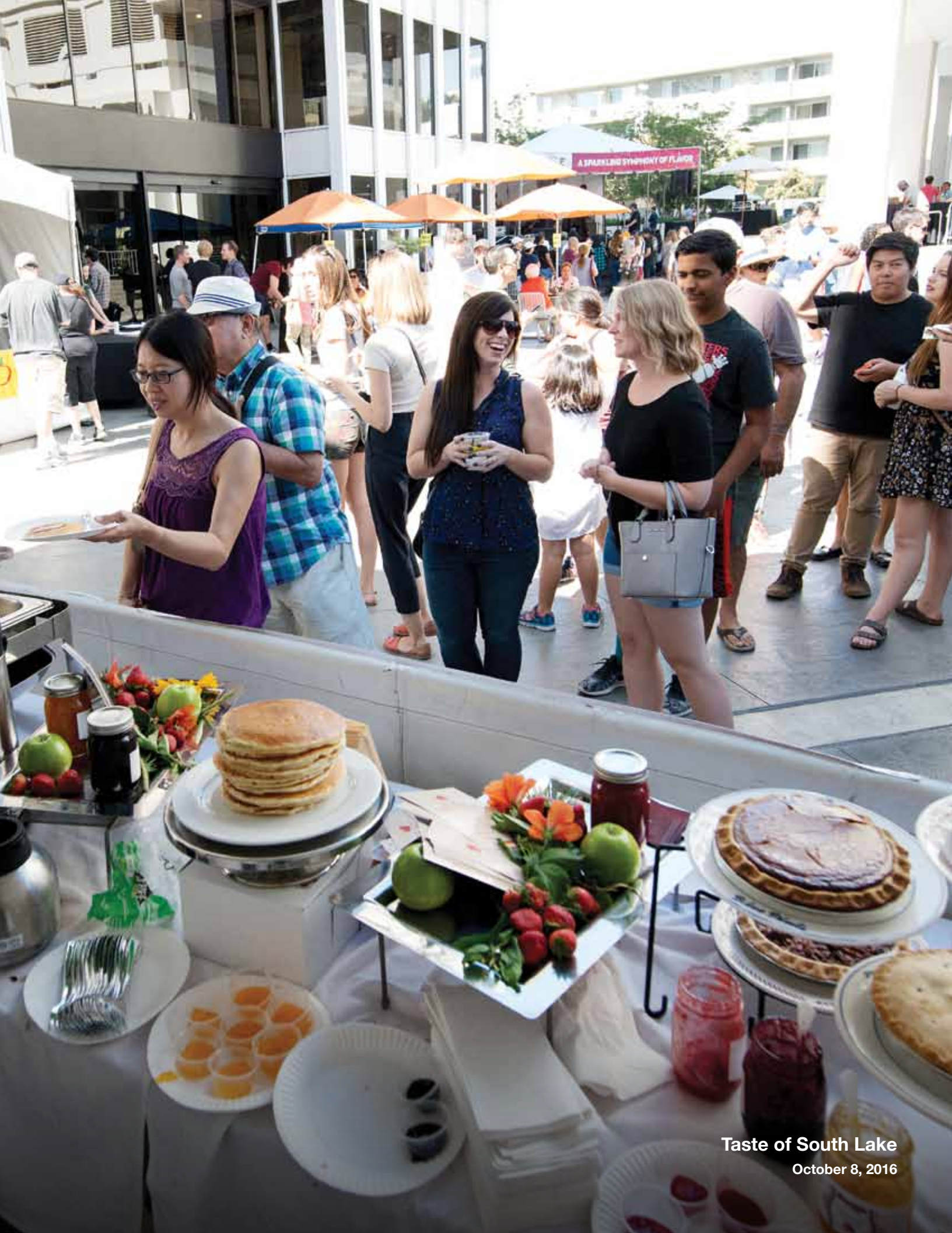
Taste of South Lake October 8, 2016