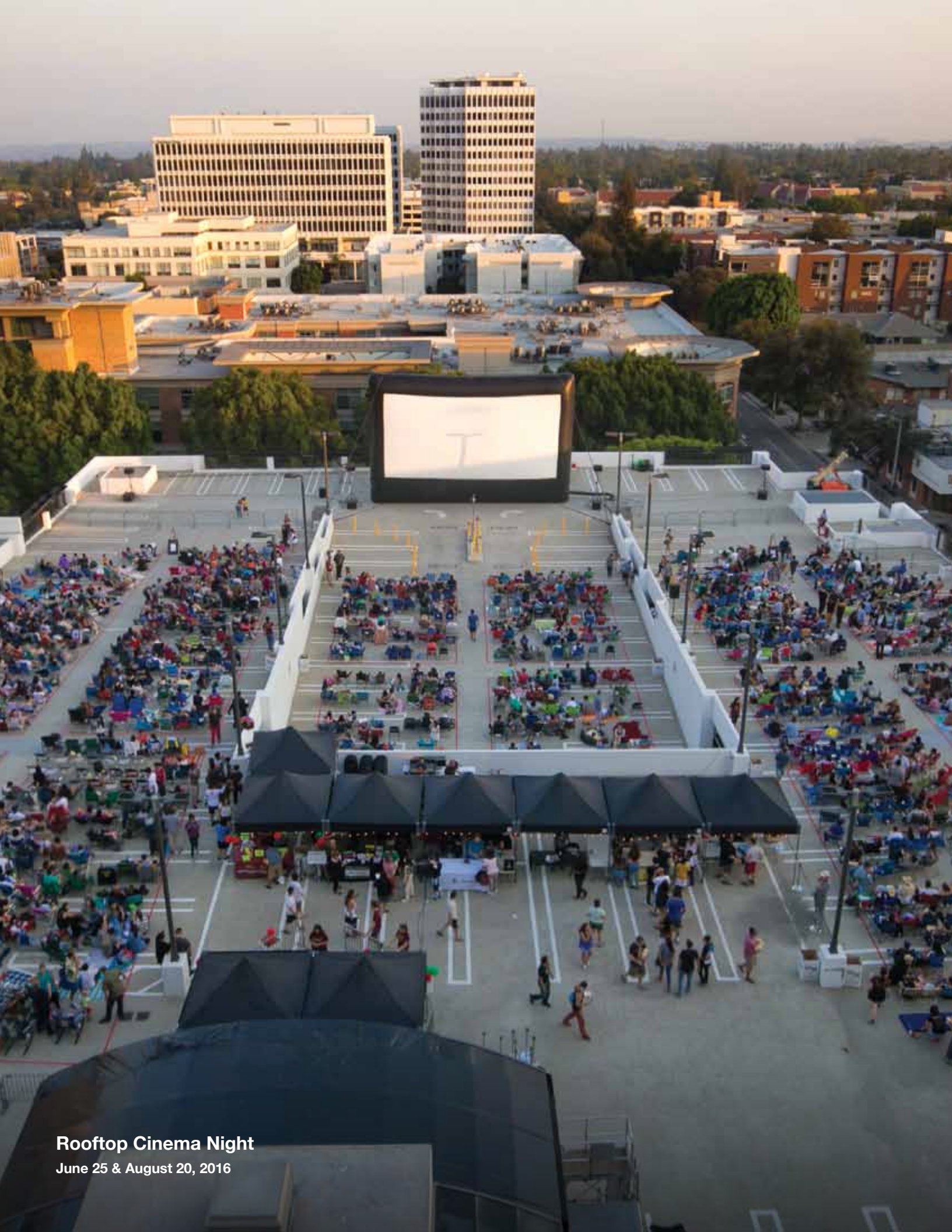
Rooftop Cinema Night June 25 & August 20, 2016