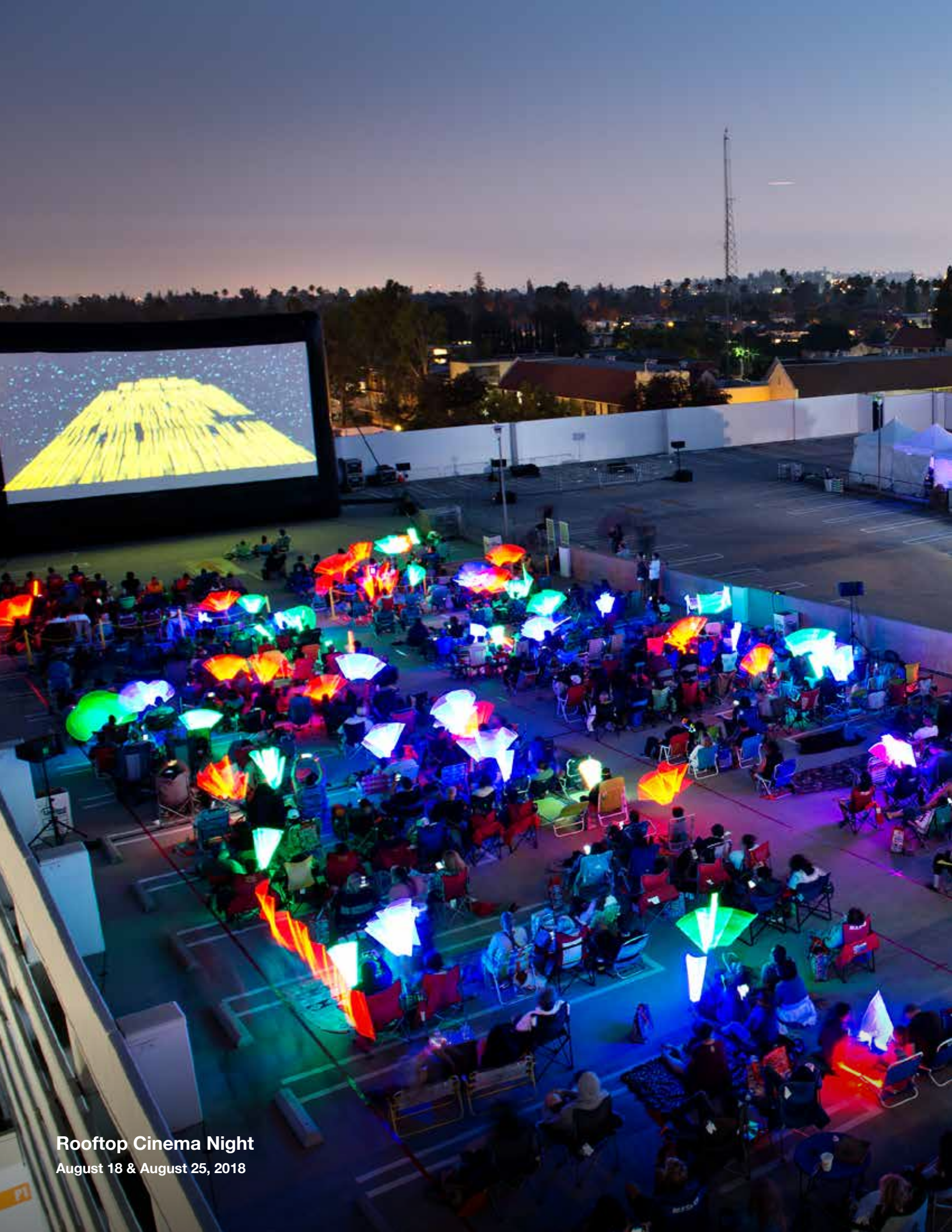
Rooftop Cinema Night August 18 & August 25, 2018