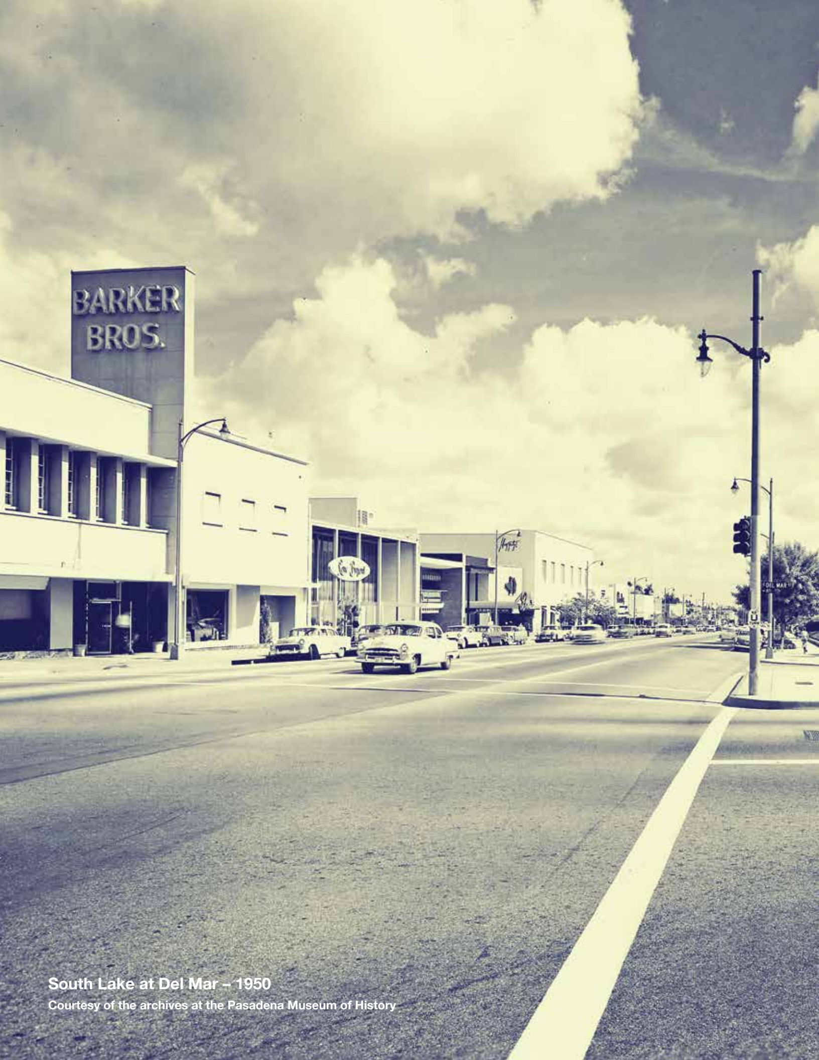
South Lake at Del Mar – 1950