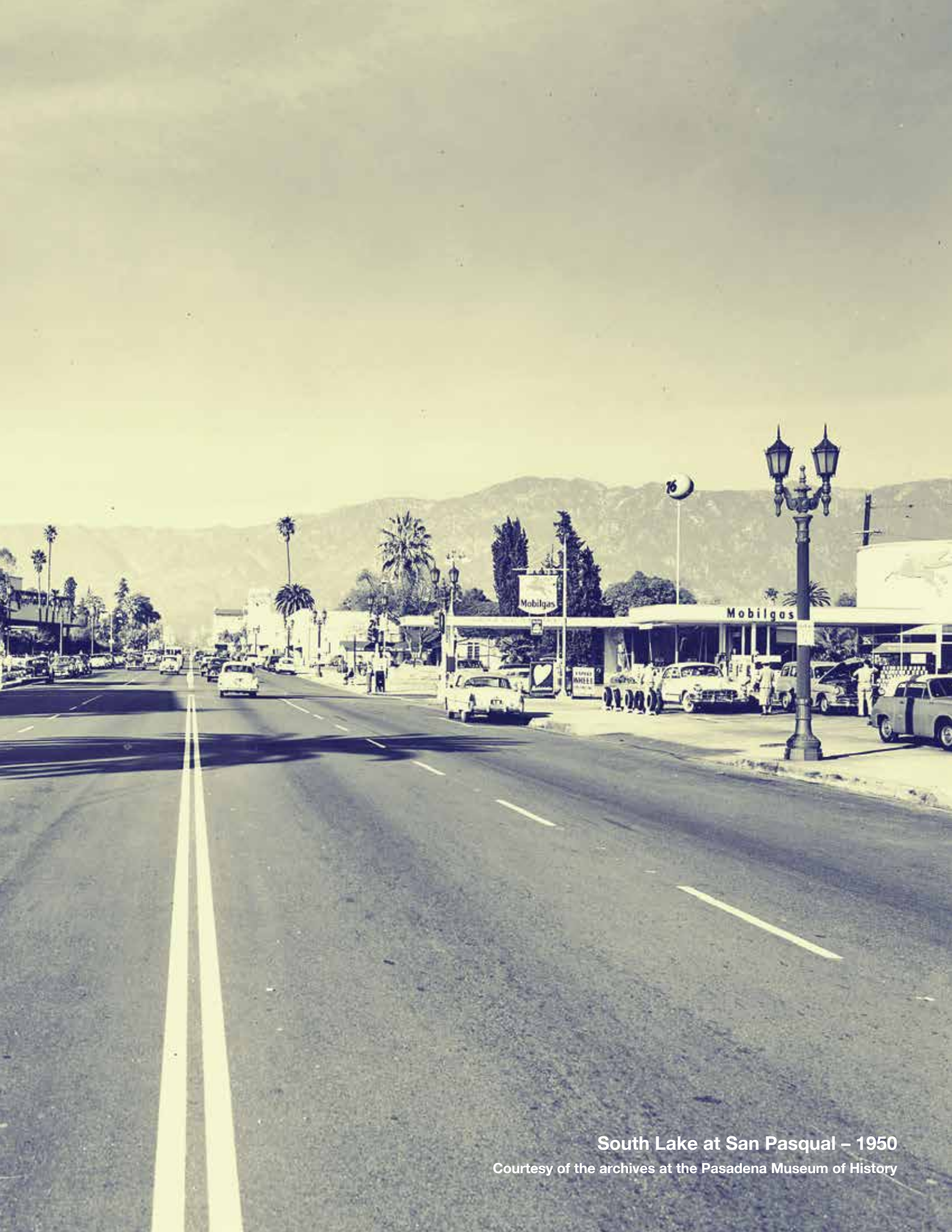
South Lake at San Pasqual – 1950