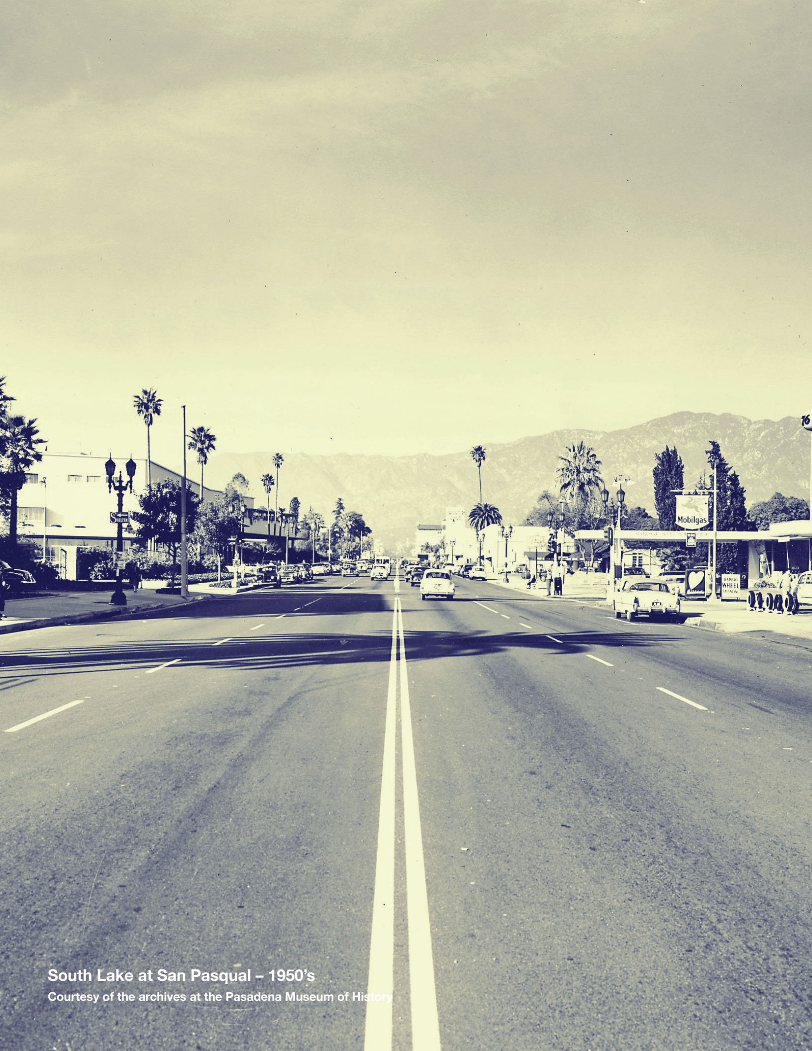
South Lake at San Pasqual – 1950's