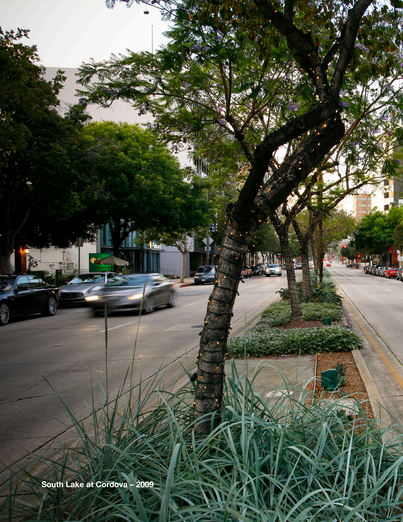
South Lake at Cordova – 2009