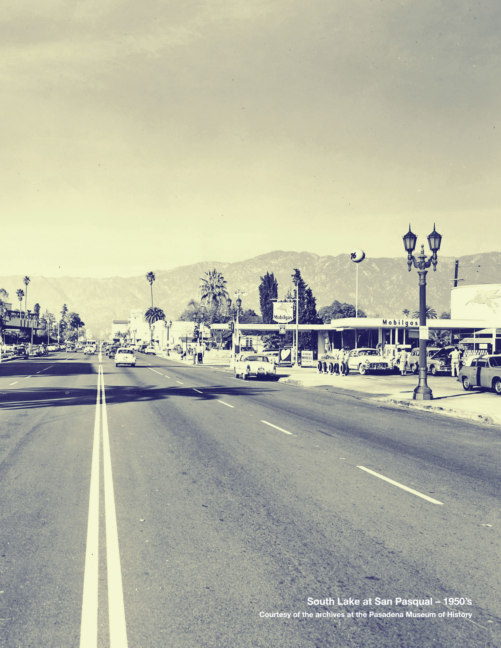
South Lake at San Pasqual – 1950's