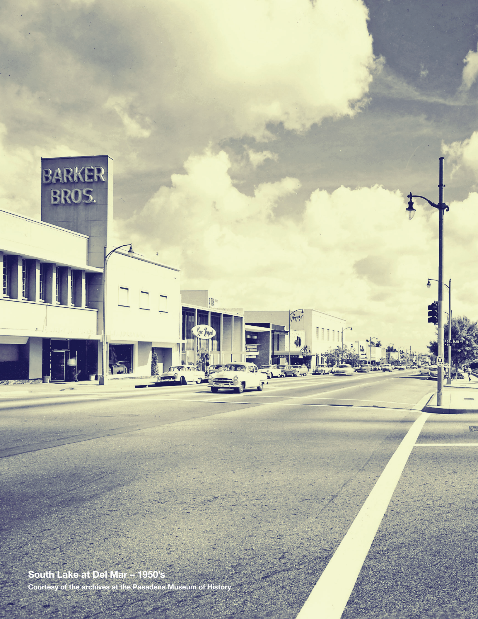
South Lake at Del Mar – 1950's