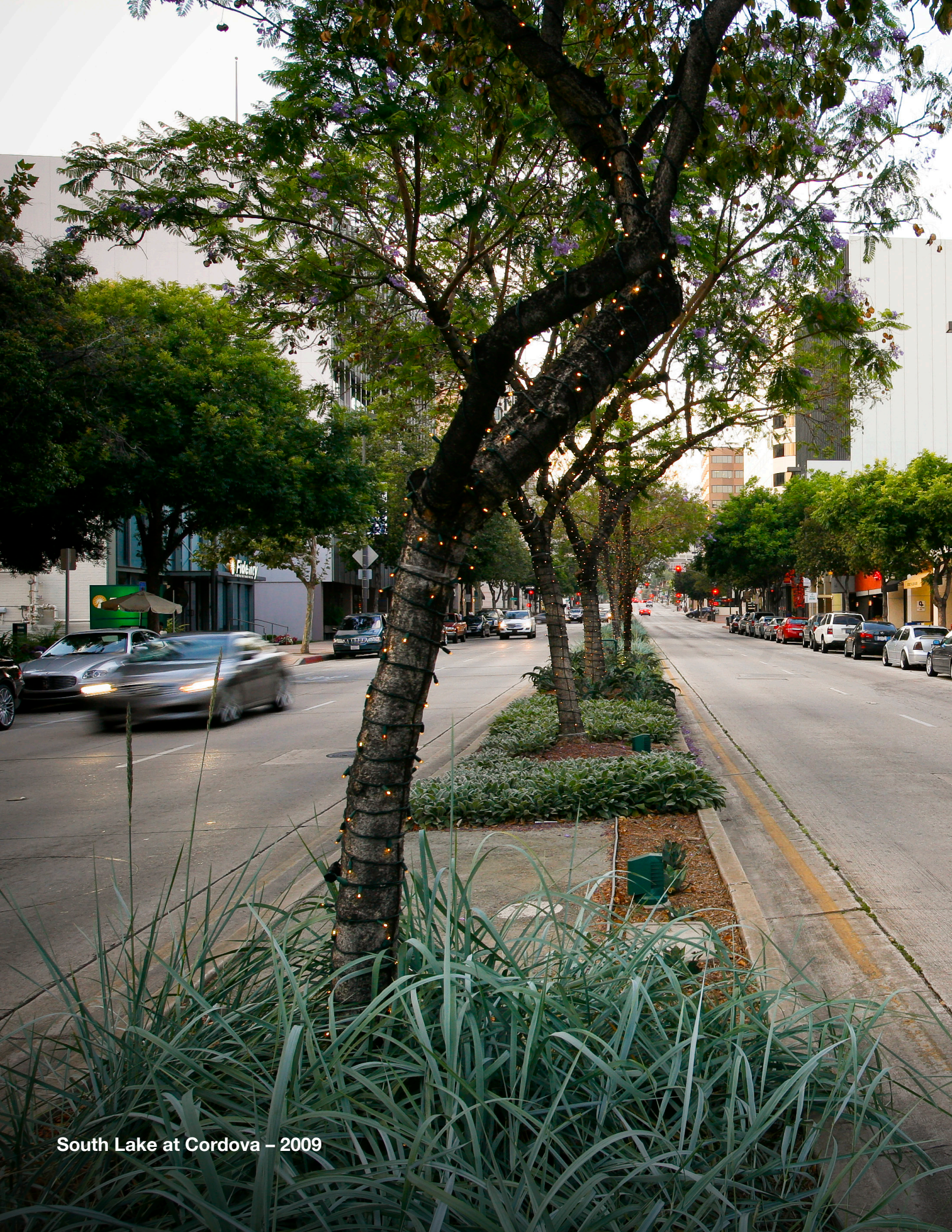
South Lake at Cordova – 2009