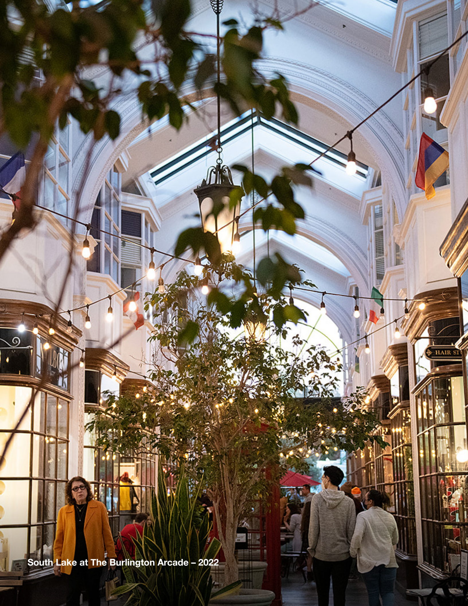
South Lake at The Burlington Arcade – 2022