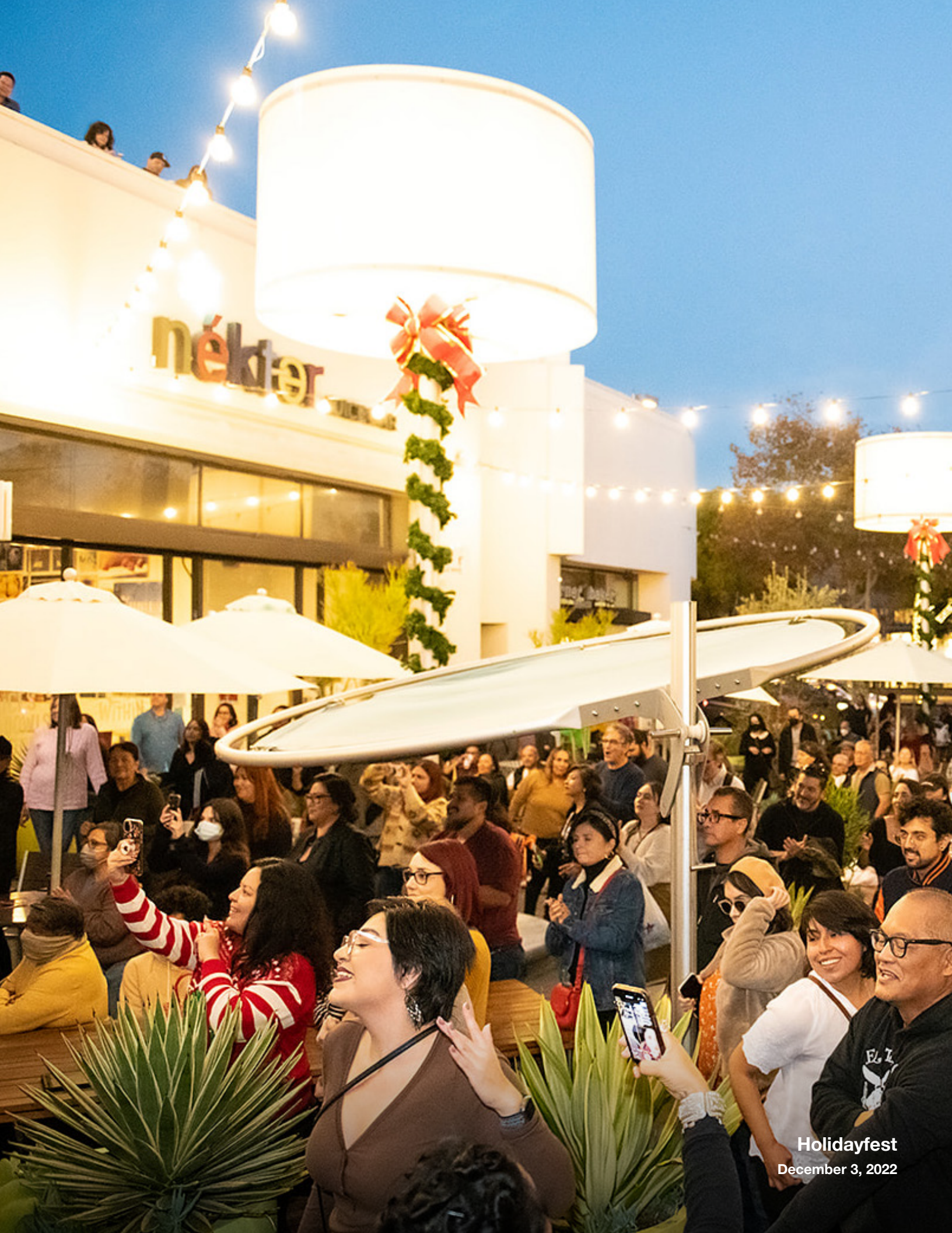
Holidayfest December 3, 2022