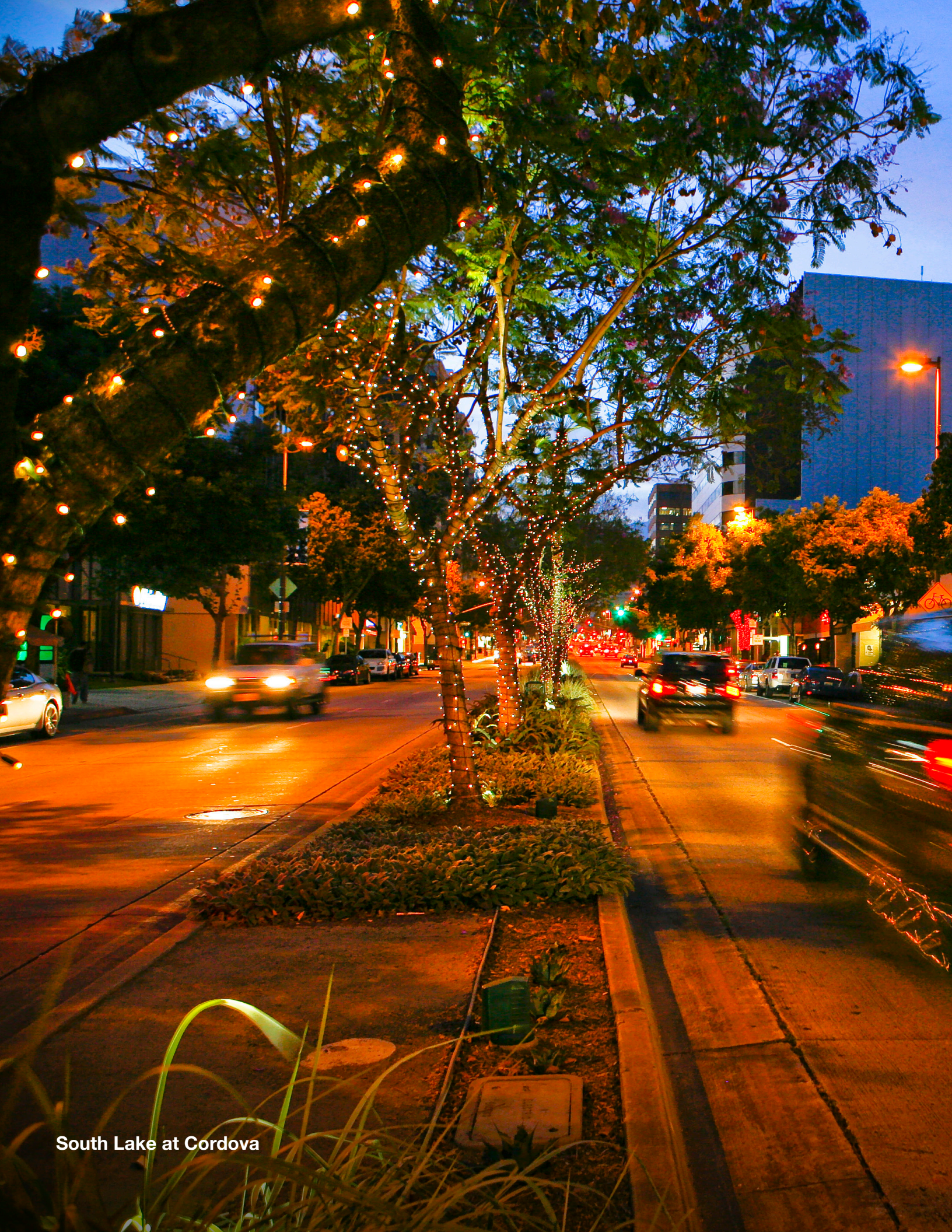
South Lake at Cordova