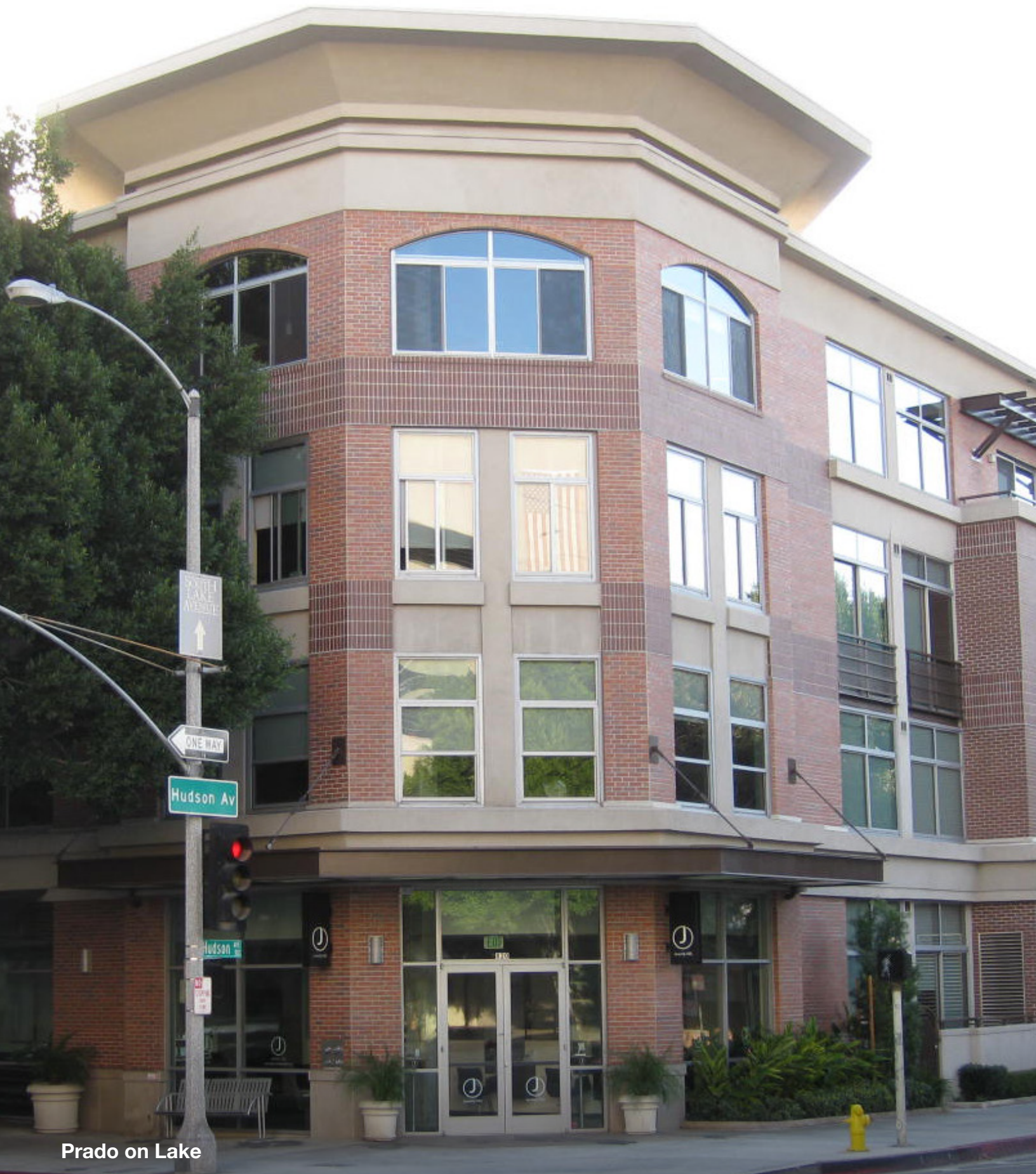
Prado on Lake