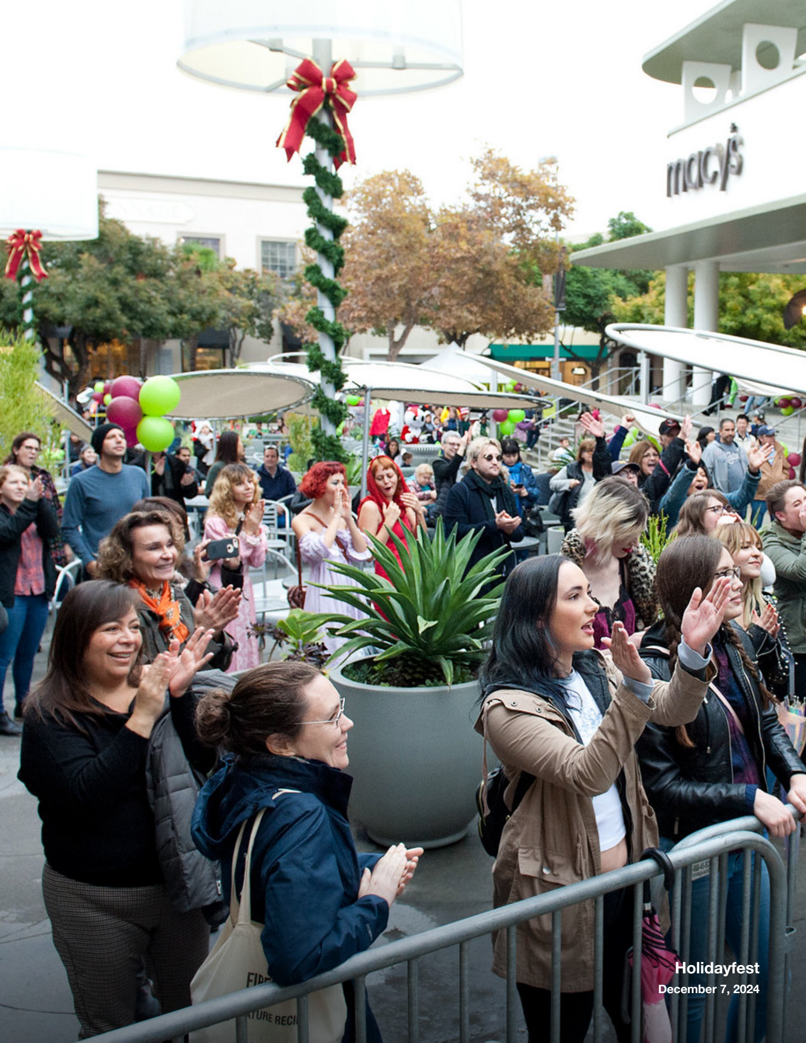
Holidayfest December 7, 2024