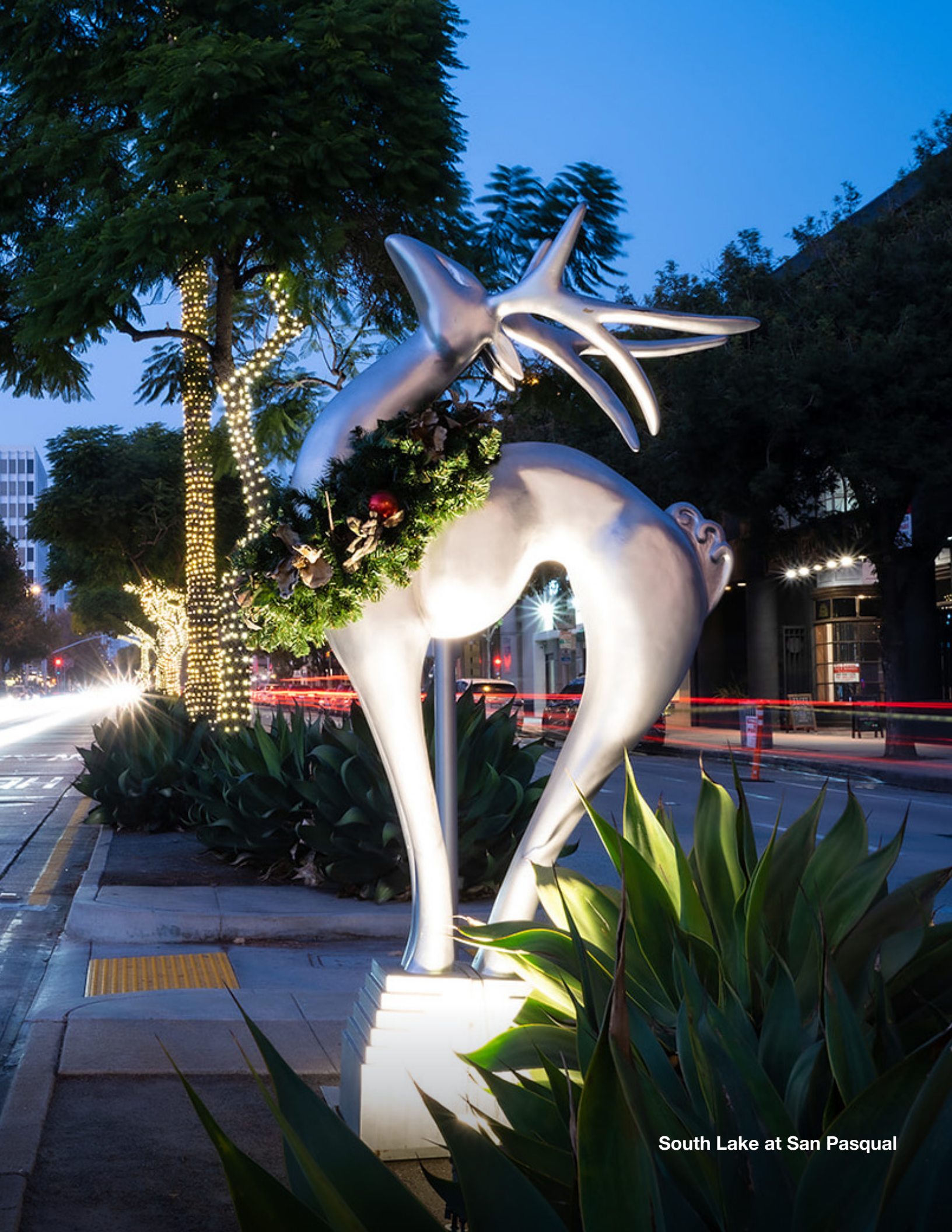
South Lake at San Pasqual