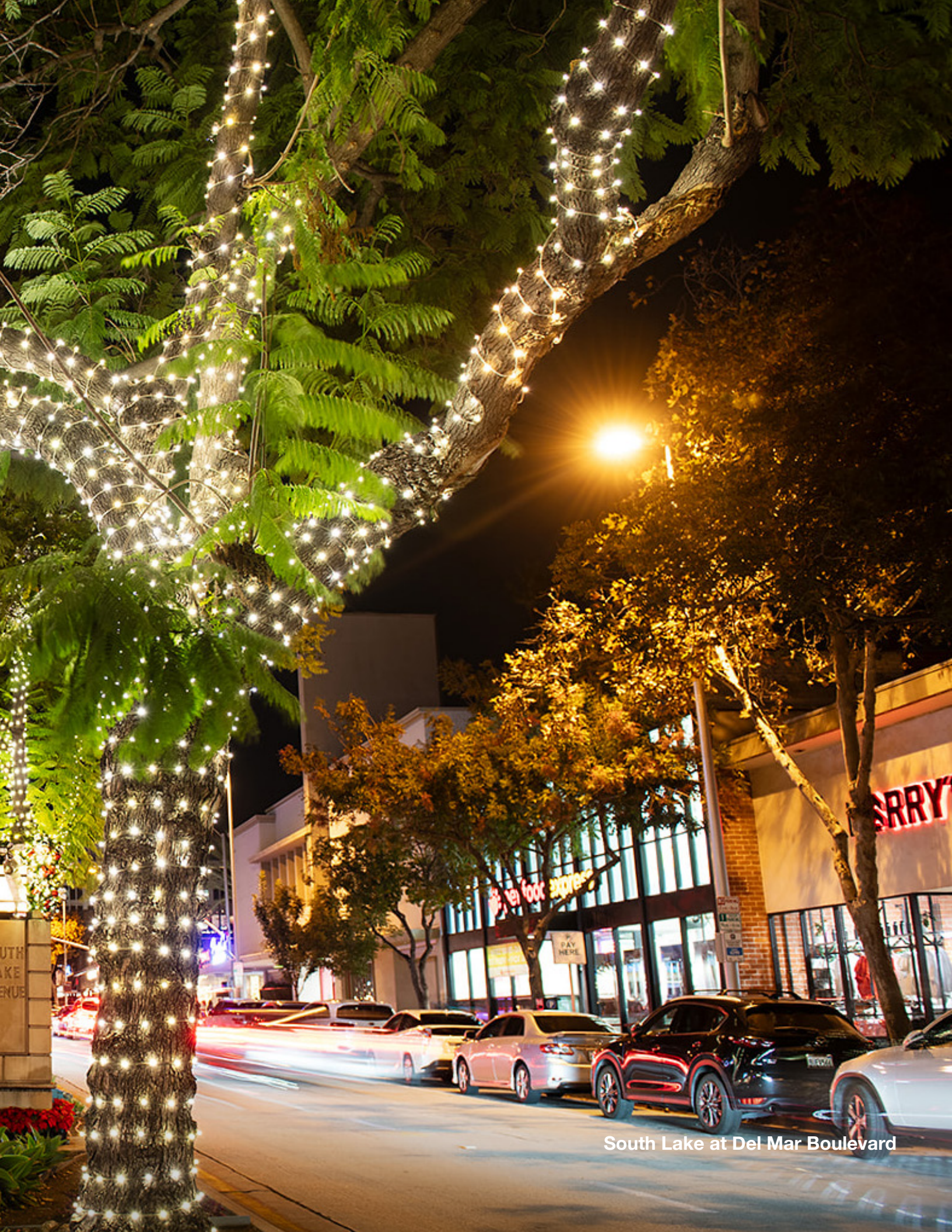
South Lake at Del Mar Boulevard